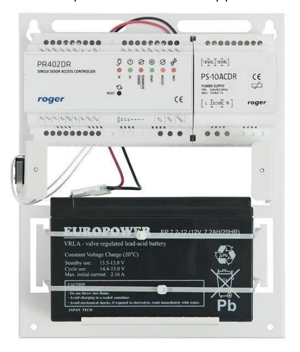
Fig. 2 Internal view of enclosure with installed PR402DR access controller, power supply module and back-up battery fastened with cable ties