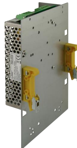
Fig. 2. Example of power supply mounting.